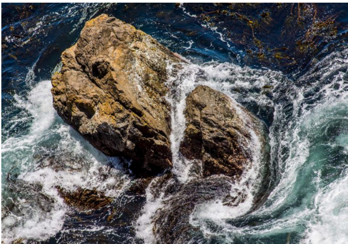
Swirling Ocean, Big Sur