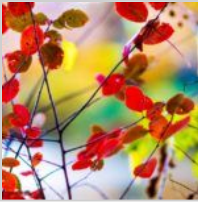
Central Park Autumn abstract