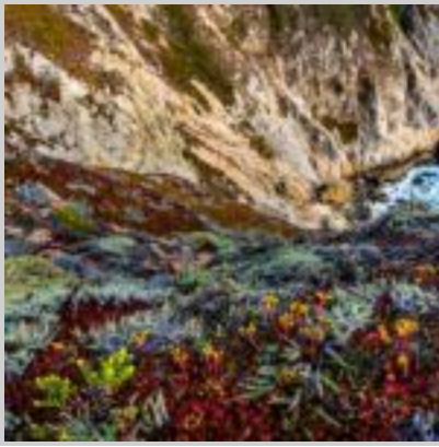
California, South of San Fran